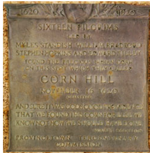
1620 1920 Sixteen Pilgrims

Led by Miles Standish, William Bradford, Stephen Hopkins and Edward Tilley Found the precious Indian corn on this spot which they called Corn Hill , November 16th, 1620.